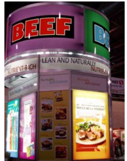
The beautiful beef display at the Food and Nutrition Conference in Philadelphia.

You: New Web sites, including www.family-mealtimes.org and www.school-wellness.org , debuted at events as well. Other sites of interest include www.beefnutrition.org , www.NutrientRichFoods.org , www.zip4twens.org , www.beef-itswhatsfordinner.com , and www.beeffrompasturetoplate.org . Check them out for yourself!