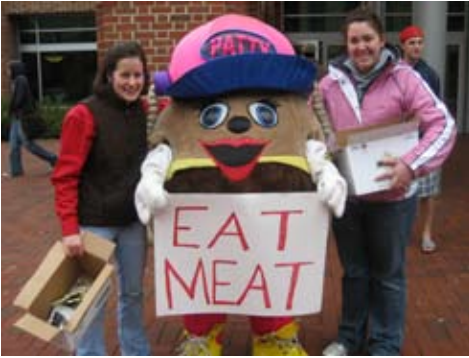
Penn State students organize second annual “Meat-In Day” at University Park campus.