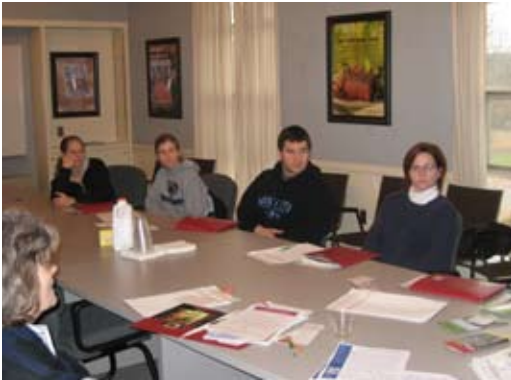
Penn State dietician interns learned how nutritious beef is at the Beef Council.