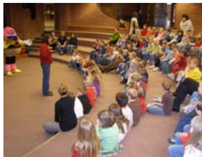
Patty Melt visits students and serves meatballs.